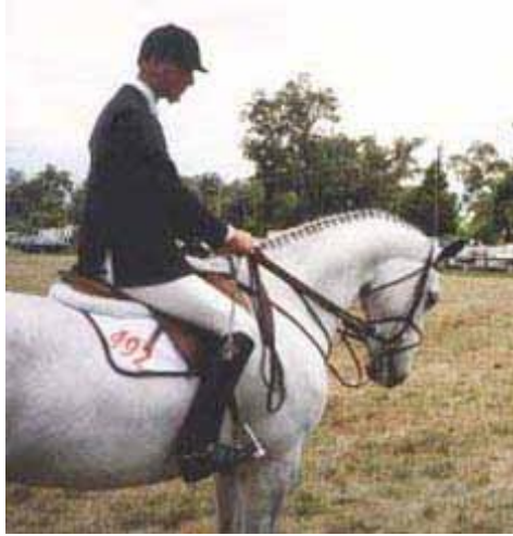
Horse: Cottage Norman Perfect line from Elbow to bit and heels down

straight line from elbow to bit). The point here is that no matter where your hands needed to be (up or down), they needed to not break the straight line from elbow to bit.